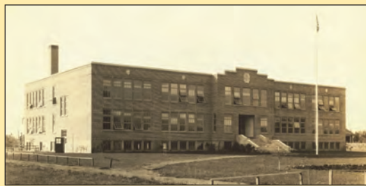
The first Battle Ground High School was built in 1928 on Parkway, just north of Central School.