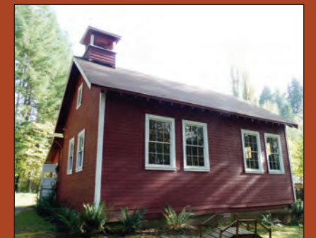
ABOVE: Venersborg School, now used for a community hall, is finally getting indoor plumbing!