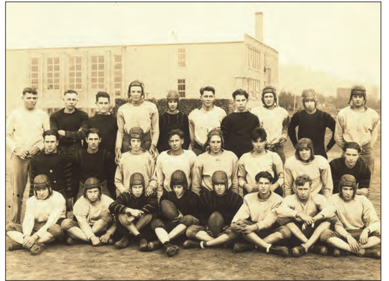
Battle Ground High School Football team in 1931 or 1932.

Just north of Chief Middle School is Captain Strong Primary, which opened for the 1990-91 school year. This same general area is home to CAM Jr.-Sr. High School (Character, Academics, Marketplace) and HomeLink Battle Ground.