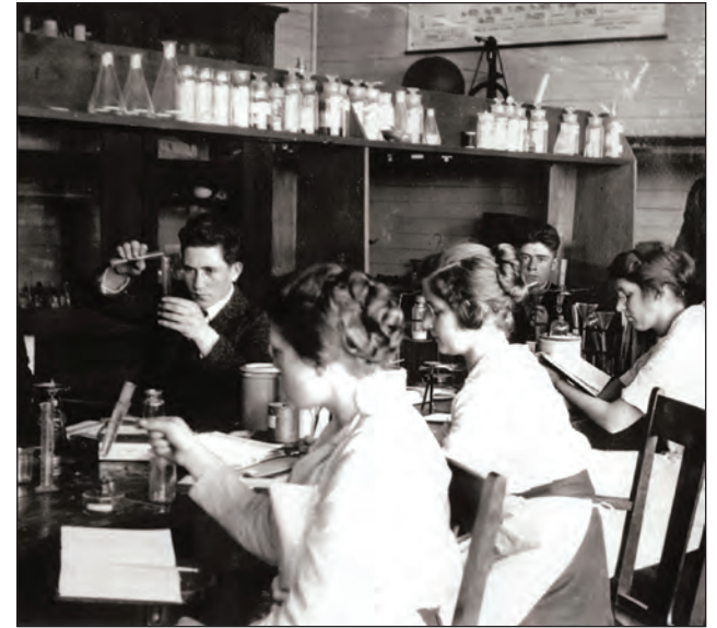
Yacolt High School science class in 1917.

Present-day Battle Ground School District — with 20 schools, 13,000-plus students and covering 271 square miles (43 percent of Clark County) — is a far cry from the one-room log structures of the late 1800s.