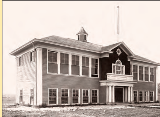
The original Central School, built in 1910, sat at the northwest corner of Main and Parkway.

This plot, between Parkway and state Highway 503 and between Main Street and Onsdorff Boulevard, has expanded and evolved over the decades as it has been the school home to tens of thousands of students, from pre-school to adult education. It is the birthplace of myriad memories for generations of local residents.